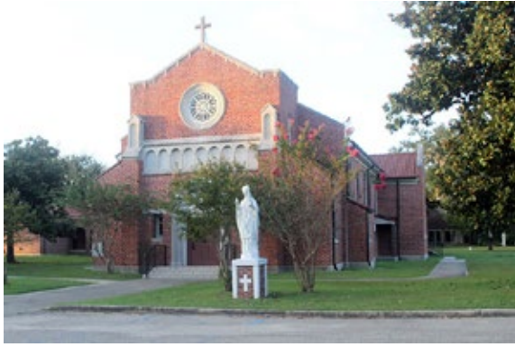
Saint Augustine's welcomes all to our historic grounds and chapel.